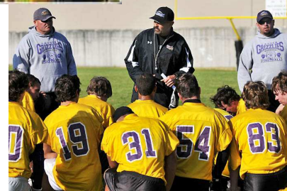
The 2011 18th Annual Gold Beach Football Team Camp ... "Gold Beach Camp - champions built one play at a time" theme for 2011 camp.

Probably first and foremost are cost and location.