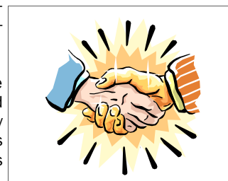
No deposits ... no contracts

have teams who have signed up drop for one reason or another and teams on the waiting list move up to attend camp.